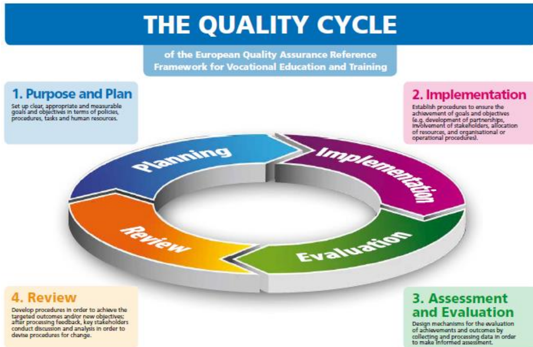
Figure 2: The EQAVET Quality Cycle

The EQAVET quality model is based on the plan-do-check-act (PDCA) cycle and describes four stages: planning, implementation, evaluation/assessment and review/revision of VET which are interrelated.