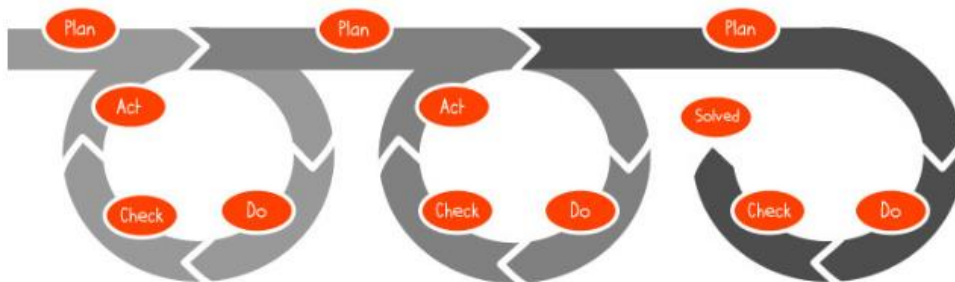
Figure 3: The PDCA Cycle: cyclical processes, testing and accumulation of knowledge, which will then inform the main, process (Windolph & Blumenau 2019)

The quality cycle is also being used to ensure the overall project quality by constantly