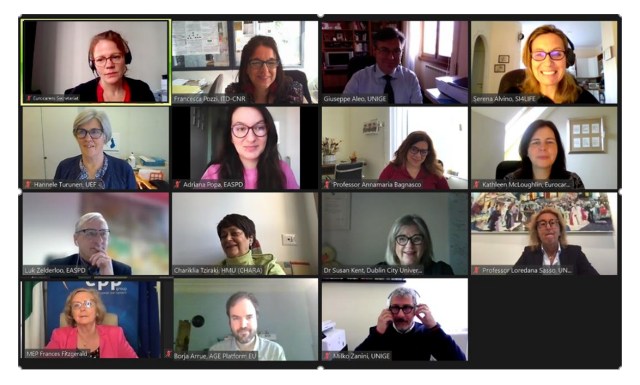
FIGURE 1. SCREEN SHOT OF ZOOM WEBINAR PANELISTS OF ENHANCE FINAL CONFERENCE, 20 MAY